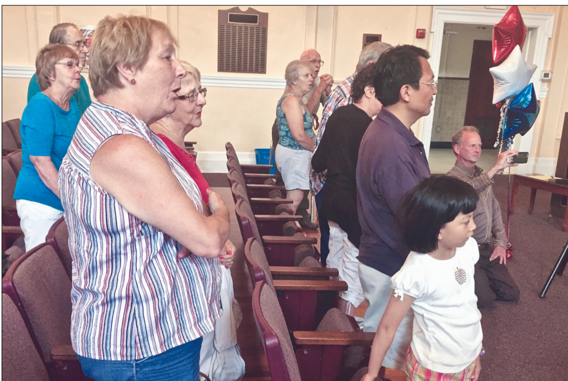
As the program concluded, the audience stood and sang "America the Beautiful."